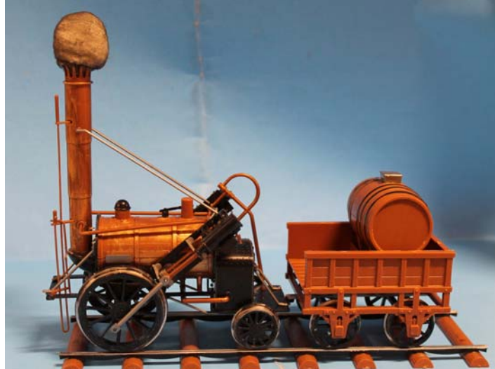
Chuck Converse built this 1/26<sup>th</sup> AHM "Rocket" early locomotive