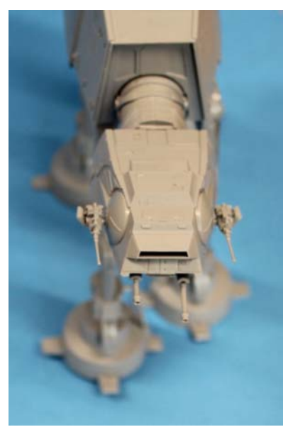
Icie Cook's latest "work in progress" is this nice 1/144th Bandai Star Wars AT-AT